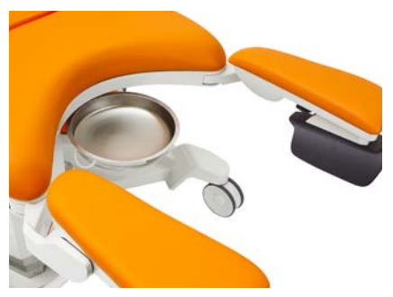
Sliding stainless catch basin 4.51