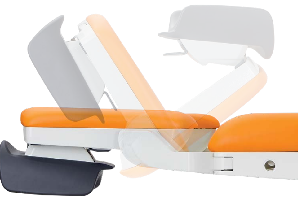
Quick adjustment of the leg rests into the required position.

The firm conception of leg rests enables the care team to respond very quickly and effectively to different situations which may occur during the delivery.