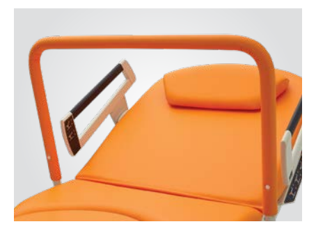
Supporting upholstered bar