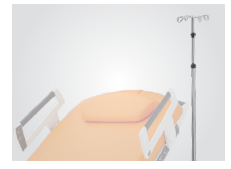
Telescopic infusion stand