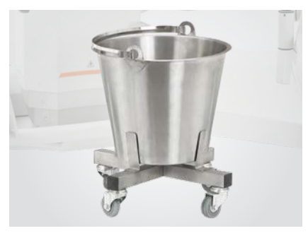
Stainless steel bowl with castors