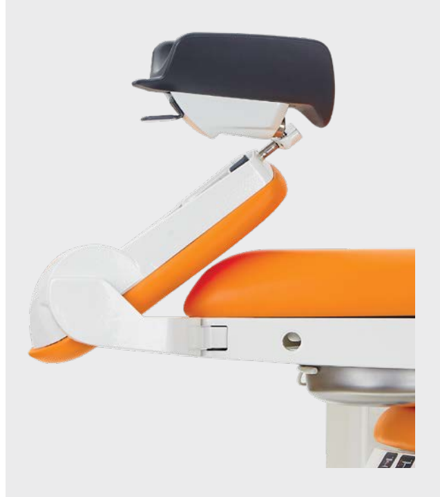
The tray height adjustment for different femur sizes.