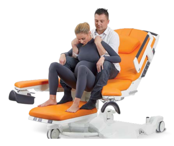
Half sitting with partner assistance