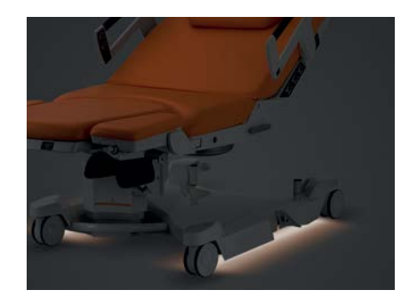
Under bed light