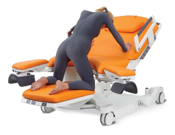
All fours position