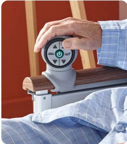
No cable or battery

Residents can set their bed independently to the best position to get out and support themselves on the SafeLift controller.