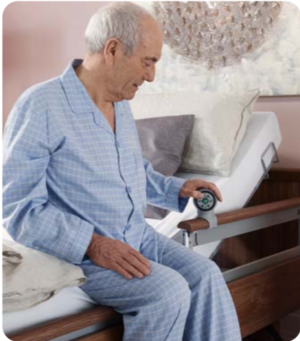
Mobilization and standing-up aid

Residents can set their bed independently to the best position to get out and support themselves on the SafeLift controller.