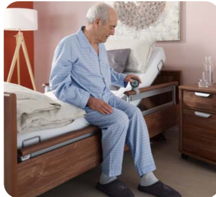
Standing-up and mobilization aid