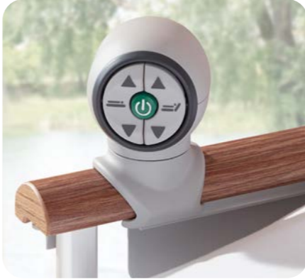
Cable- and battery-free controller