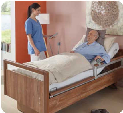
Simple bed operation for residents

SafeLift offers the simplest operation so that residents can adjust their bed independently and set it to the best mobilization position for them. At the same time, they can support themselves when standing up on the SafeLift controller.