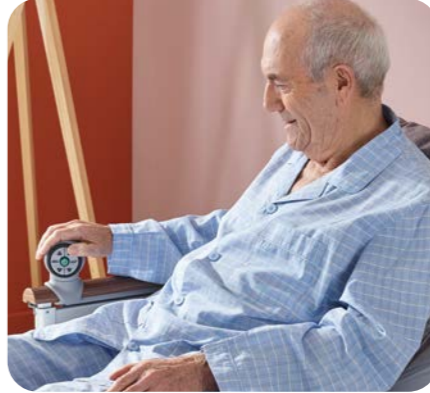
Customized for each resident